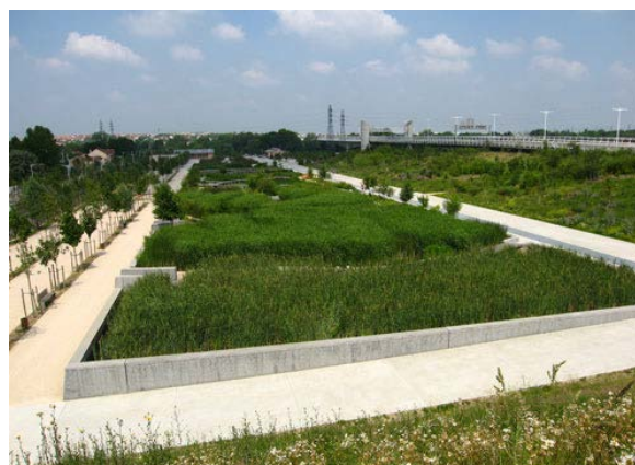
Application of Phytoremediation

http://systemsbiology.usm.edu/BrachyWRKY/WRKY/Phytoremediation.html